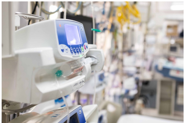
NHS treats the patients: government and contractors have screwed up PPE procurement, testing and tracing contacts

Now the Guardian suggests the task force is aiming to reverse this legislation, and “drawing up proposals that would restrict NHS England’s operational independence and the freedom Stevens has to run the service.”