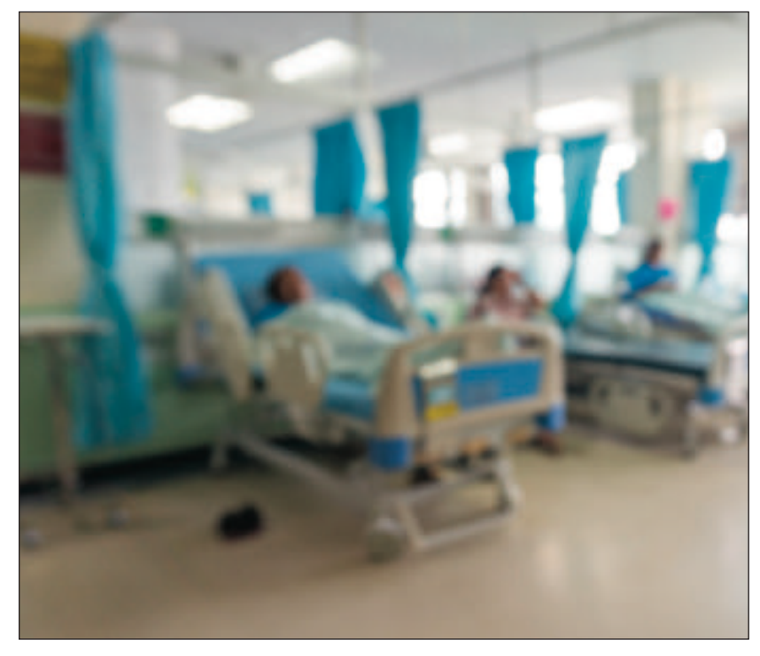
Hospital beds: lack of transparency over block-booking of private capacity

The latest available NHS England (NHSE) figures (dated 3 September) show that, of available beds open overnight, an undifferentiated 110,000 beds of all types – general, acute, mental health, maternity and learning difficulties – were occupied.