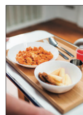
Fresh food is better for patients, says Hancock